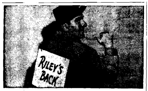
...and the fun starts tonight!